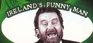
IRELAND'S FUNNY MAN