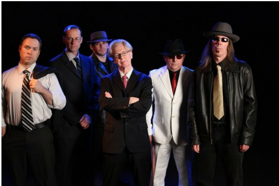
Black 47 will perform at Empire City Casino on Sunday, March 16 to honor Irish pride.