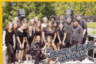
ROCK N ROLL CHORUS