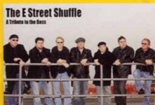
The E Street Shuffle & Tribute to the Boss