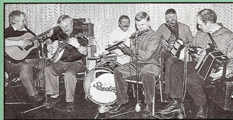
Shaskeen's 1995 line-up

Shaskeen's energy is undimmed today, the vitality that has made them one of the most popular combinations in traditional music. As they celebrate their 25th anniversary with this unique collection, the band looks forward to new horizons and fresh achievements in the years ahead.