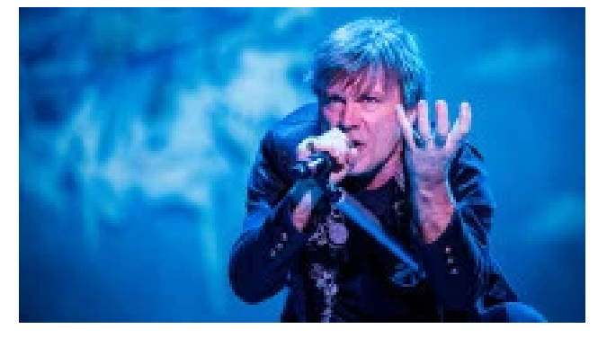
The Iron Maiden Guide To Staying Relevant In Business