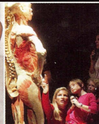
OUR BODY: THE UNIVERSE WITHIN